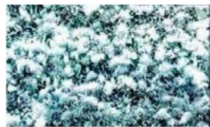
Hardness crystals after G-CAT system