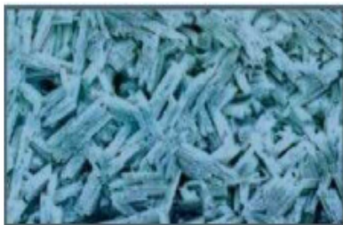
Hardness crystals before G-CAT system